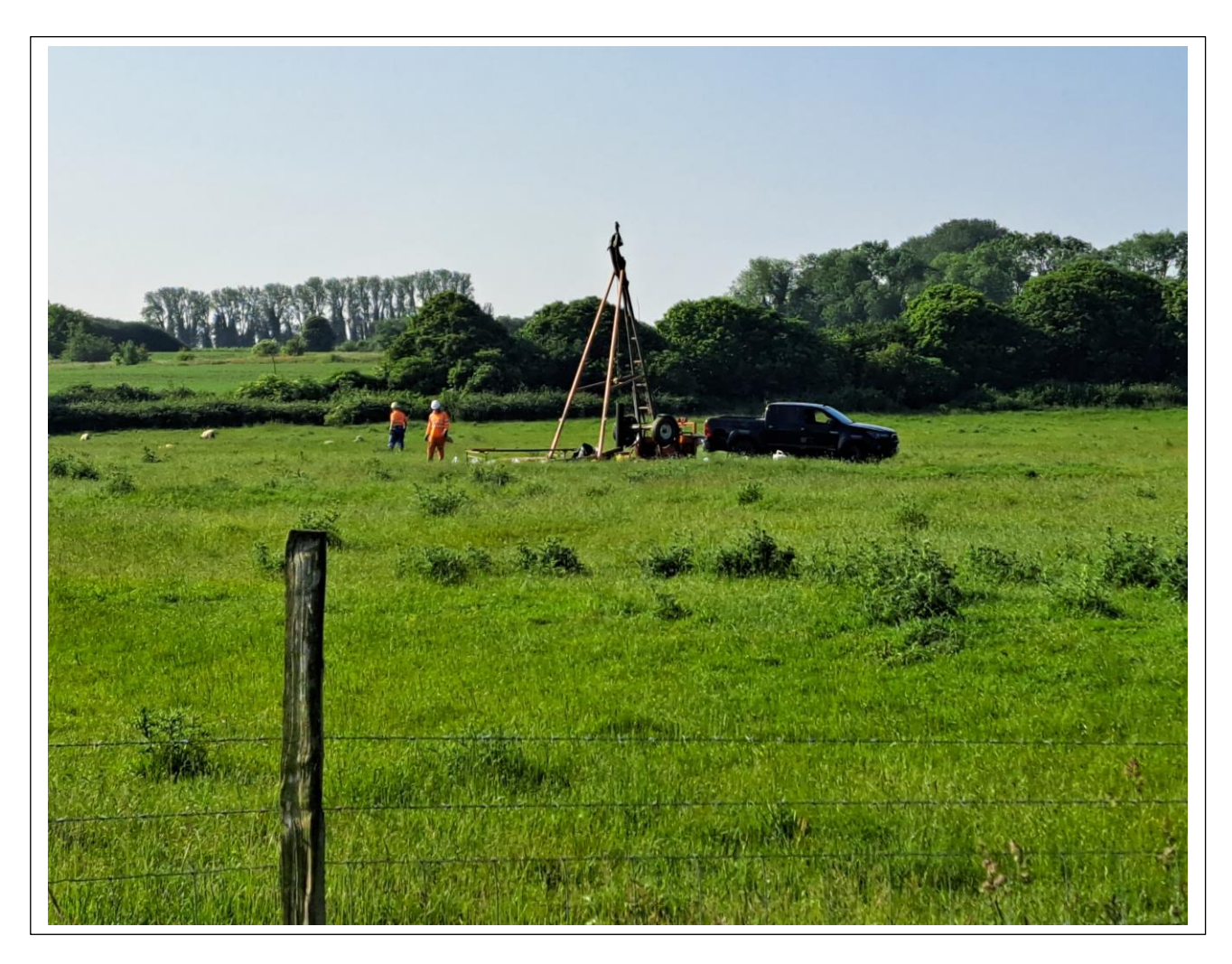
Soil sampling on the Walnut Tree Meadow Nature