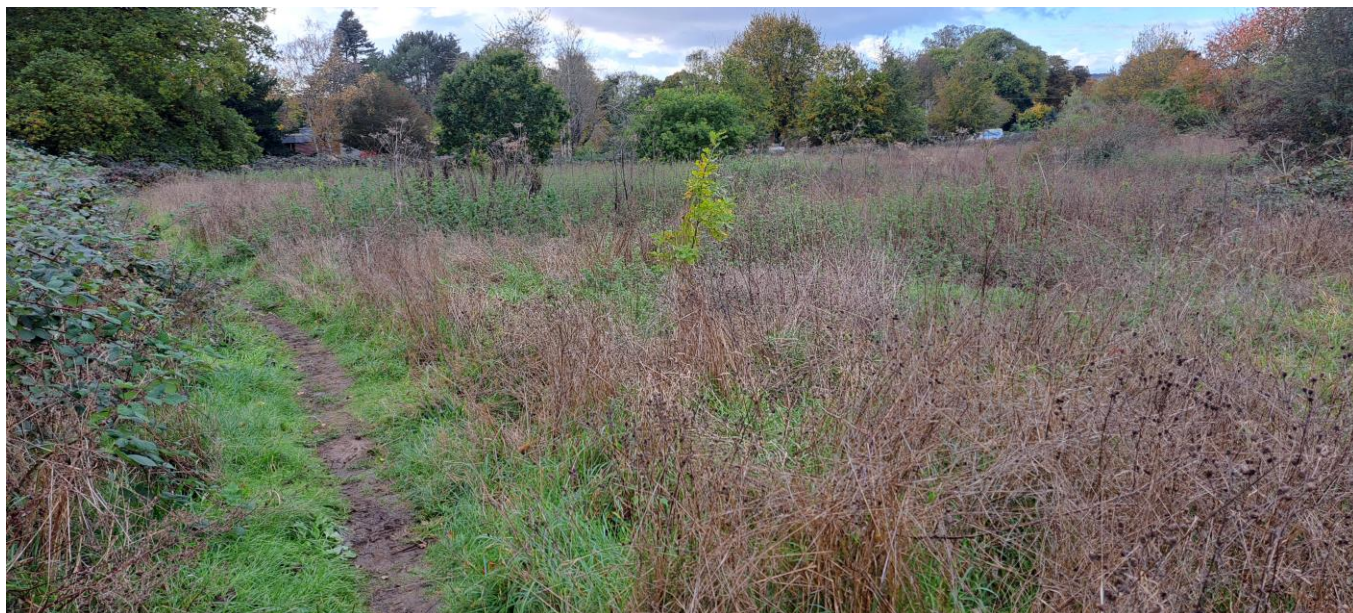
The Cricket Field today

The applicants propose to use the private drive off Teasaucer Hill that leads to Hayle Place to reach their development, but that has caused outrage among the existing residents at Hayle Place.