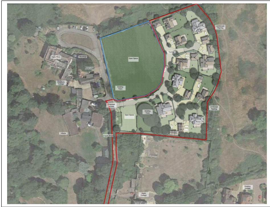
The applicants' suggested layout

It is intended they will be all-electric – no gas – with heating provided from air-source heat pumps, and there would be an EV charging point for each property.