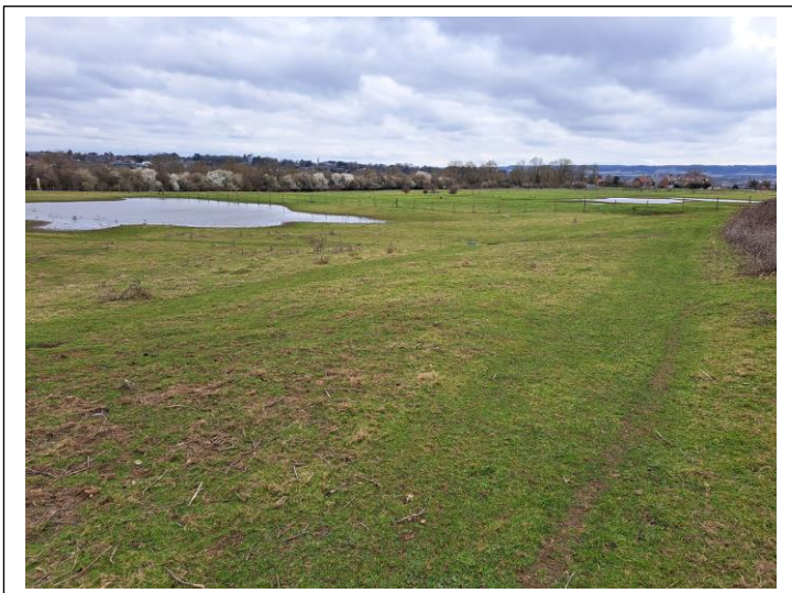
The Walnut Tree Meadow Nature Reserve

The Society is now concentrating our efforts on achieving this.