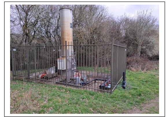
Gas is still being flared off from the landfill

The consultation closes at 5pm on Monday, November 13 .