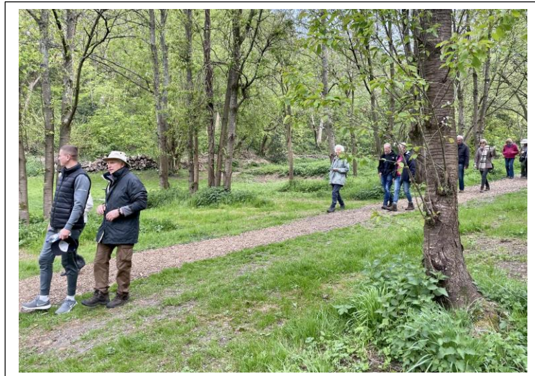
Members on a previous walk

Whether you are new to the Society, or an old hand, why not come along?