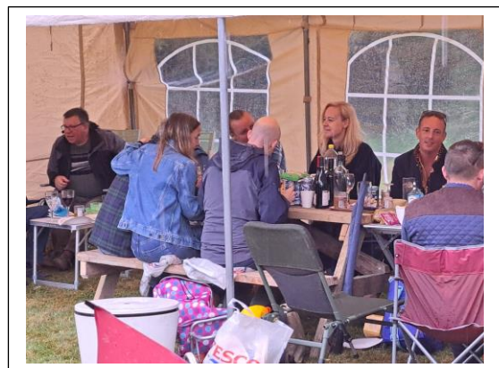
Left, guests tuck in