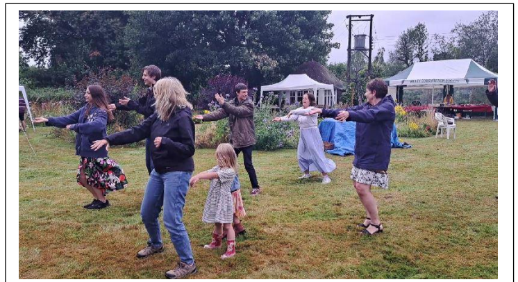
Right, dancing the Macarena in the rain