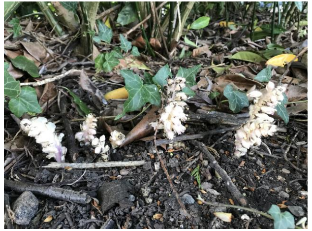
Toothwort

Photos should be horizontal, not portrait, and with a minimum of 1mb resolution. Most modern mobiles take a photo far in excess of that.