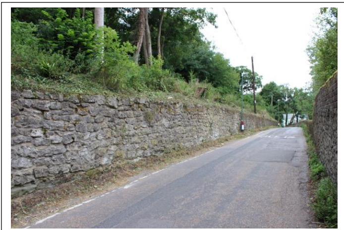
The wall alongside Treacle Wood

Anyone who has travelled up the Valley since then will have observed what a good job they did.