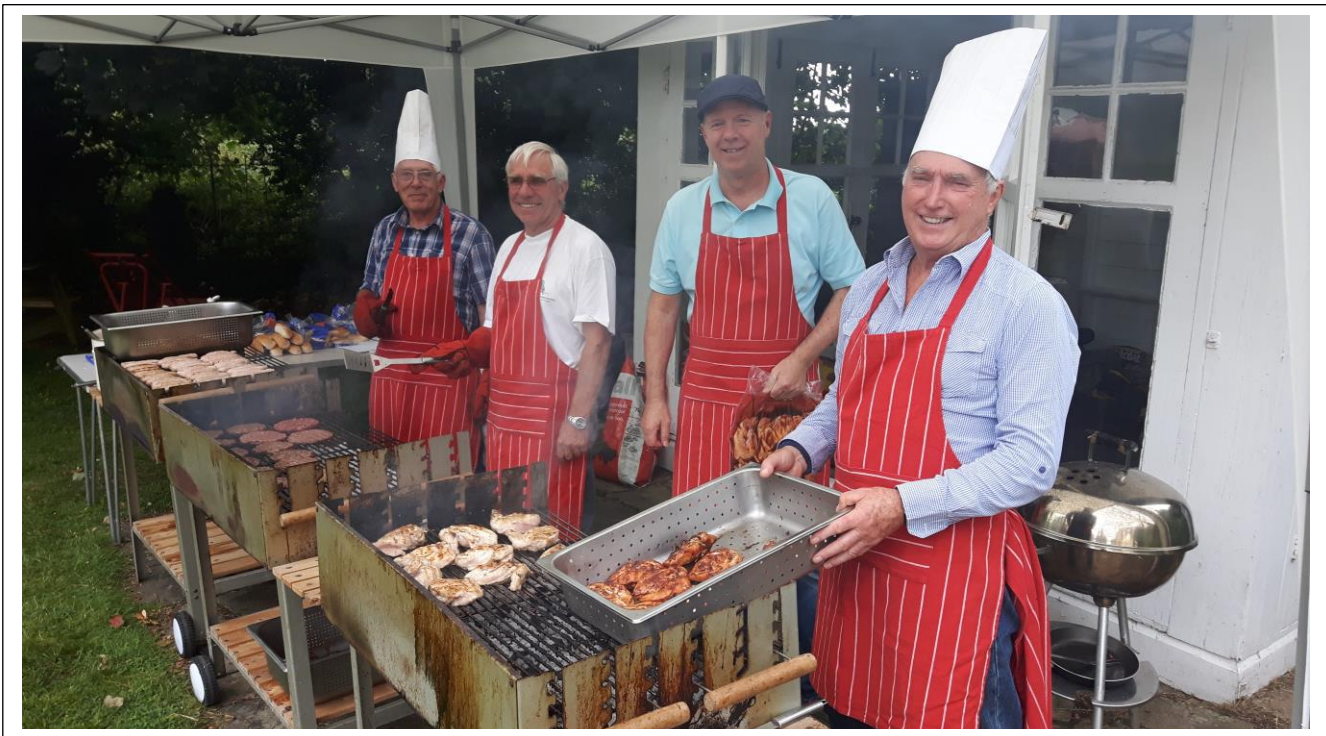
The Barbecue Boys

Music this year will be from the Soundwave Disco Roadshow who will supply us with age-appropriate hits. Doors open at 3pm. Order tickets from the secretary as above.