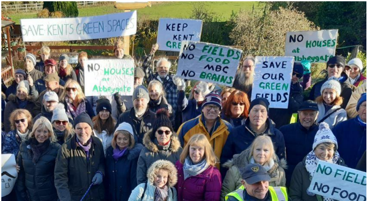
Above, just some of the walkers who took part.