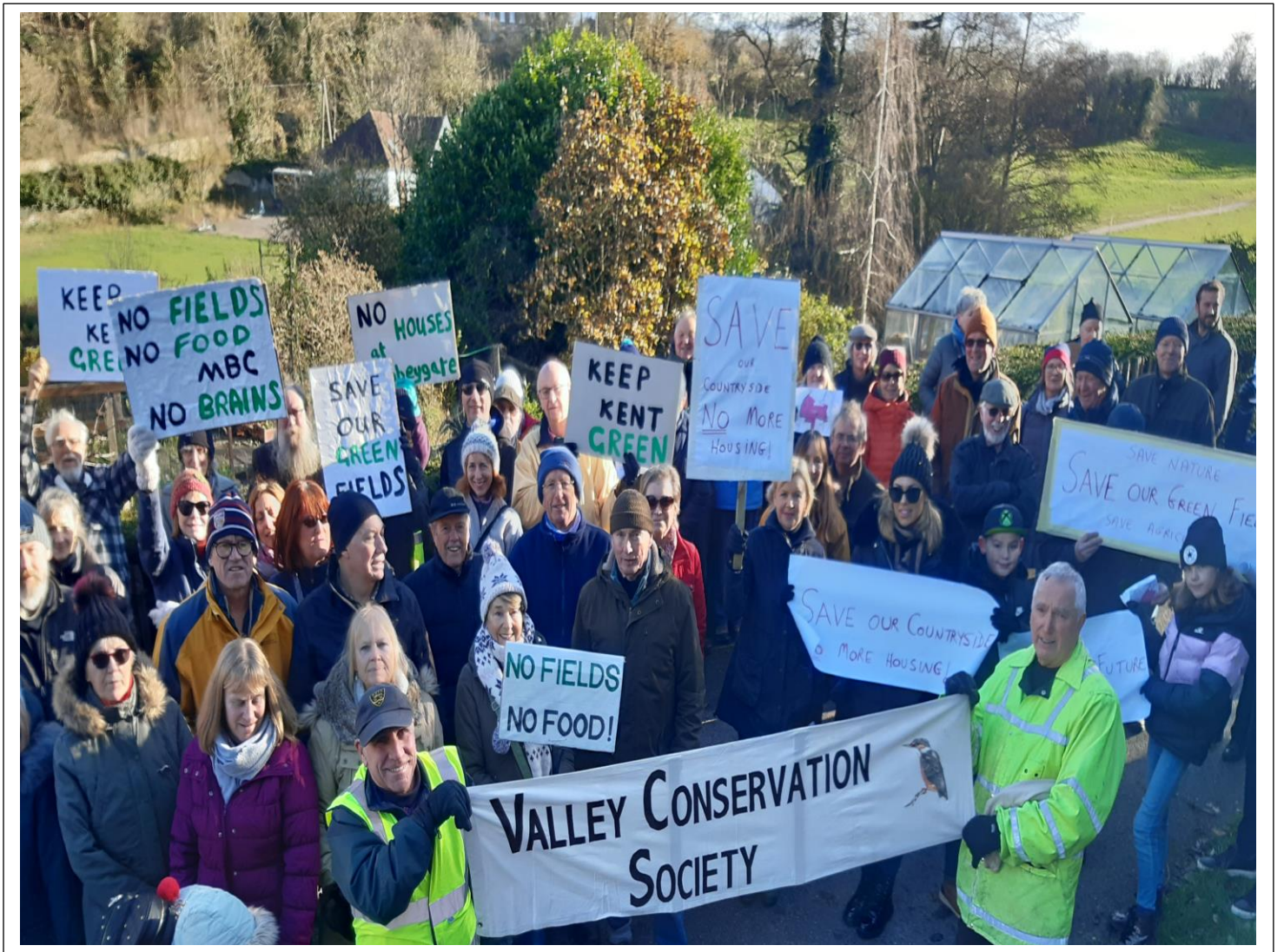
Above, the start of the walk, below, one of the fields allocated for housing