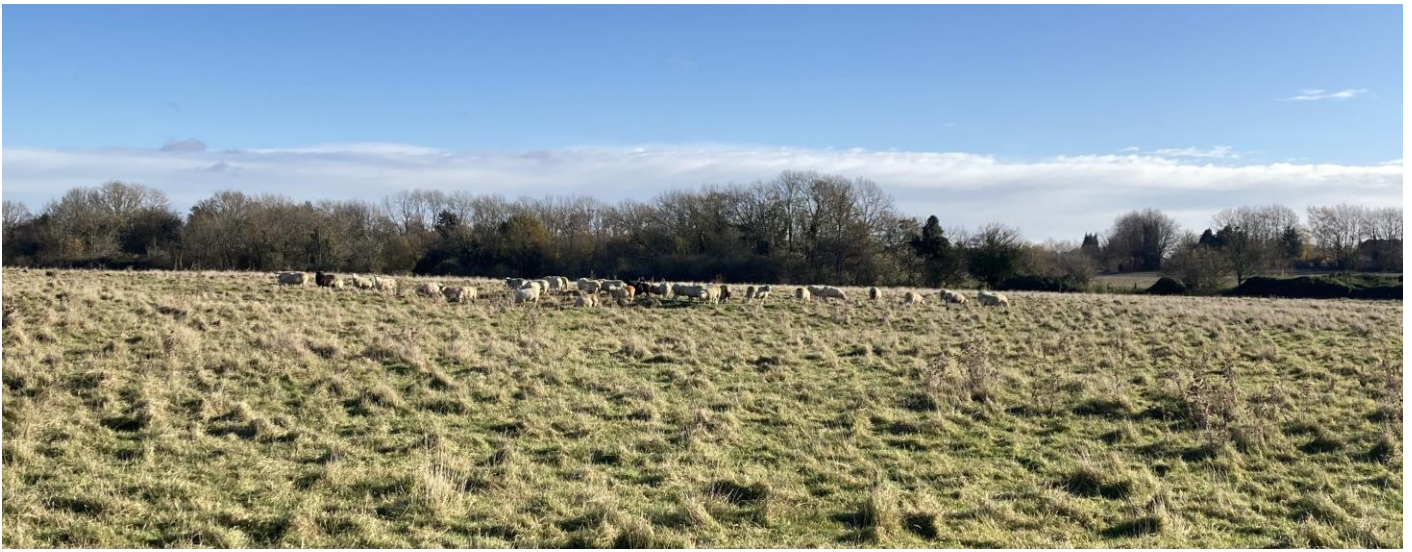
MBC wants to forge a 20-metre wide road corridor through Walnut Tree Meadows above