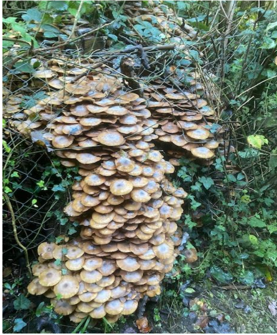
Strange sights in the valley

The work party like to have a laugh when they are busy each Tuesday, but there have been some other strange fungis in the valley recently.