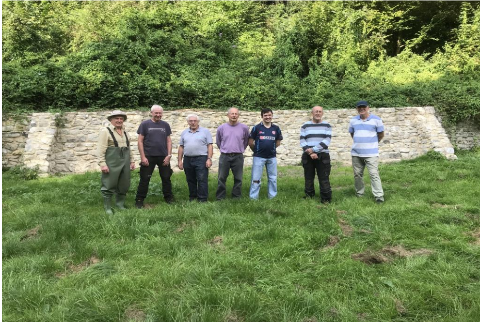
Some of the work party volunteers pose in front of their handiwork

They have included additional buttresses and water drainage this time, to ensure that they don't have to re-build it again!