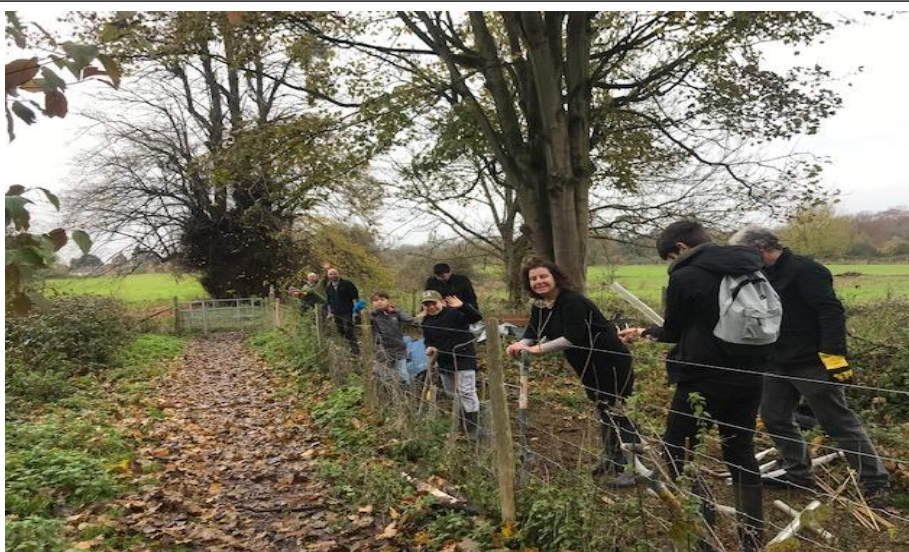
A public tree planting event in Hayle Park on Saturday, November 3