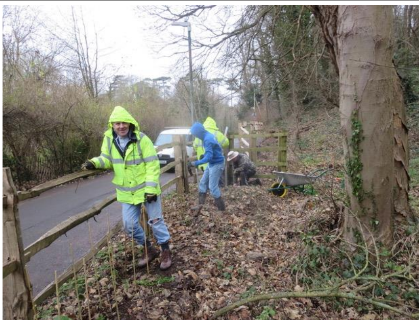
The work party plant tree whips alongside the fence in Hayle Mill Road in December