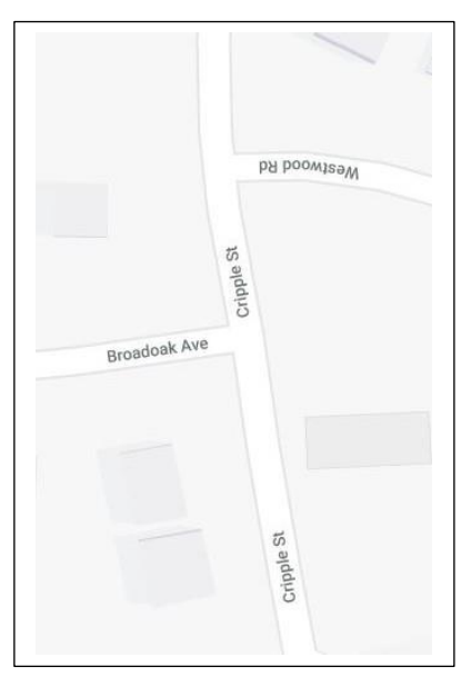
Broadoak Avenue is a turning off Cripple St.

X marks the spot for the Eling Court Day Centre and our AGM