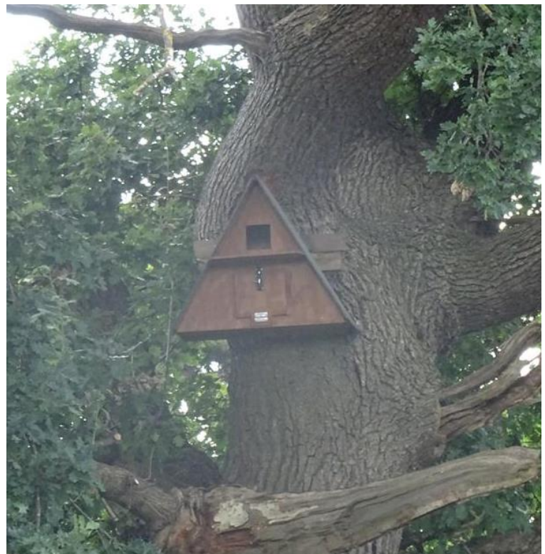
The owl box in happier times